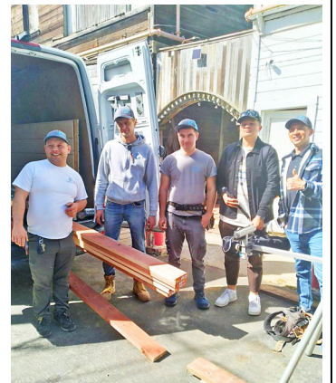
Skilled artisans from ABD

It was decided to replace the rotted wooden landing at the bottom of the north stairway that leads from River Road to Main Street. Upon reaching the stairway, it was determined that the stairway was in worse condition than the walkways and landing. So, the entire stairway had to be replaced. Then it became painfully obvious that the walkway (bridge) that connects River Road to the stairway was in horrid condition. Even dangerous. But funding was running low. In fact, there were not enough funds remaining in the LMC bank account to cover the final "bridge" construction.