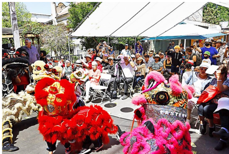
Eastern Ways lions

The first Locke Asian Pacific Spring Festival took place in 2011, before the LF began publication of the newsletter. We've come a long way.