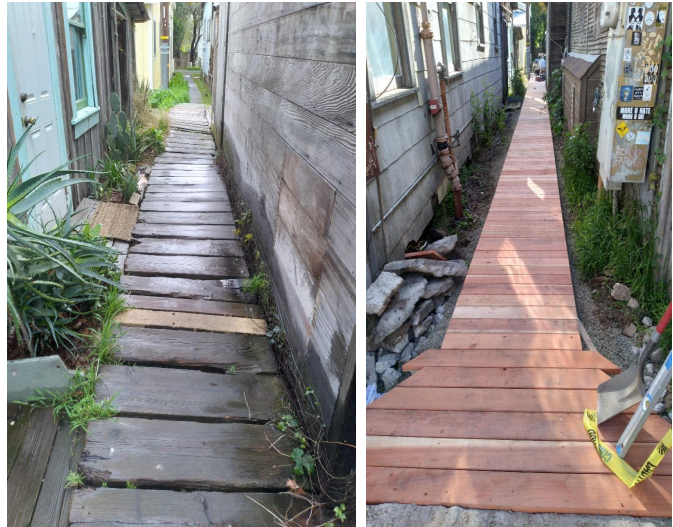
Before and after photos of walkway from Main Street to Key Street.