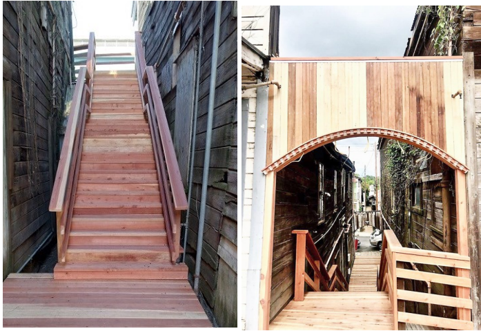
L: New stairwell and landing. R: New archway facing River Road.