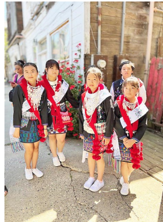
Little Sunshine Iu Mien youth dancers