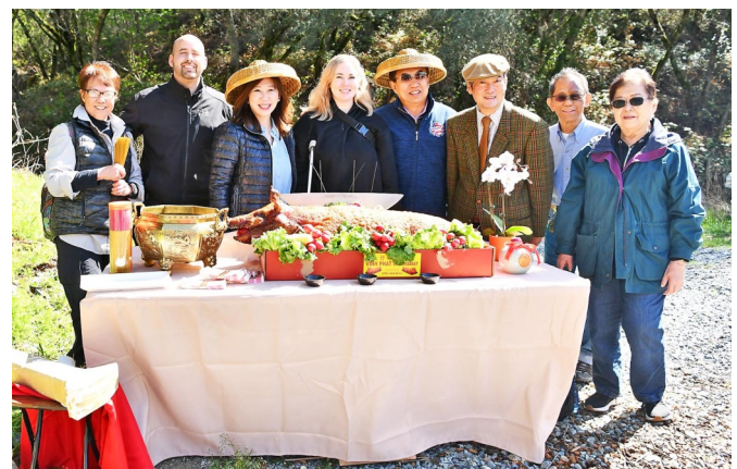
Traditional celebration of Ching Ming includes whole roast pig with accompanying side dishes.