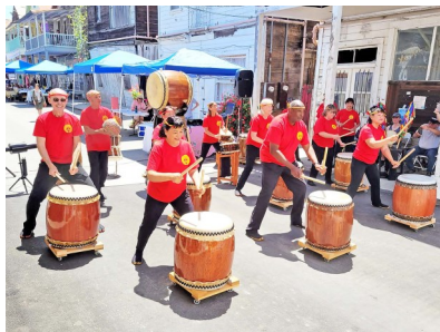
Stockton Taiko Drummers