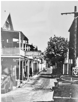
Happy Café on 13964 Main Street approx. late 1930's.