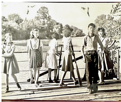
Locke kids at Pete's Place on floating platform. Circa early 1940s.

rested outside the edge of the trench. The little piece was struck on its edge and was made to fly into the air. When the batter hit the ball, he or she ran to the bases. Simple. No real ball, no pitcher, no equipment...no big deal. The kids of Locke made do. Another game was pick-up sticks.