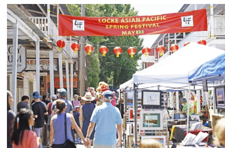
Main Street lined with visitors and vendors